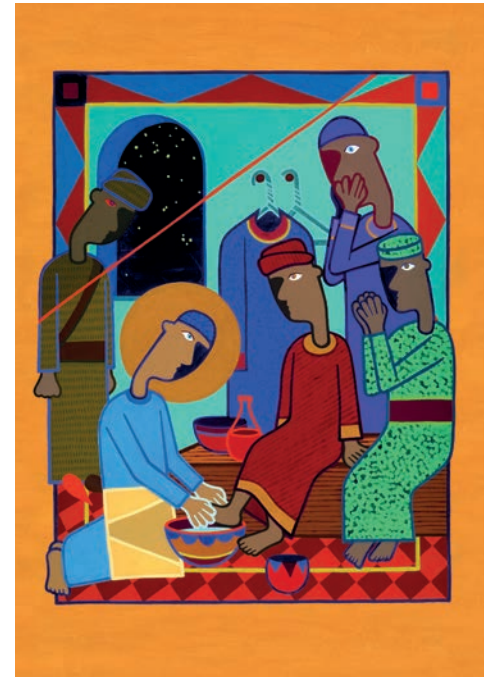
8. Jesus washes the feet of his disciples