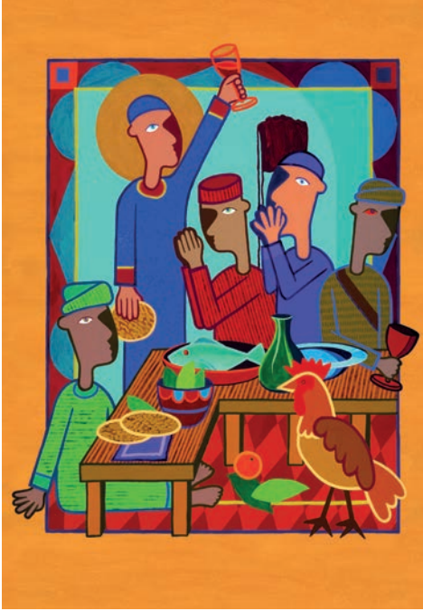
9. The Lord's supper