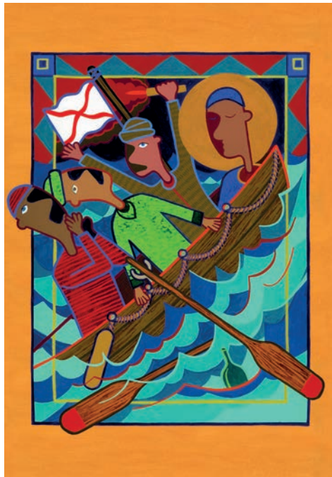
6. Calming a storm