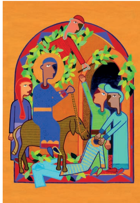
7. Triumphal entry into Jerusalem