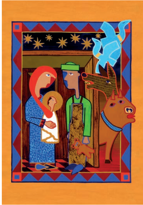
2. The birth of Jesus