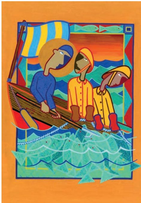
5. Fishers of men