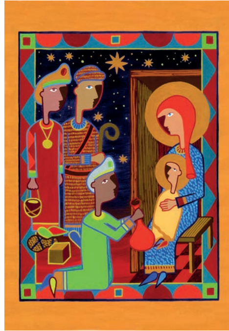
3. Visitors from the East