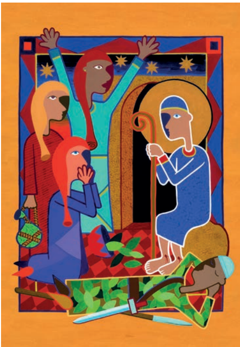
11. Jesus is alive