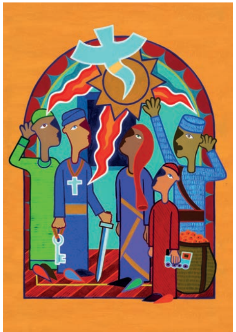
12. The visit of the Holy Spirit